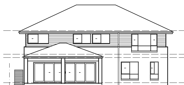
ELEVATION 3 -EAST-