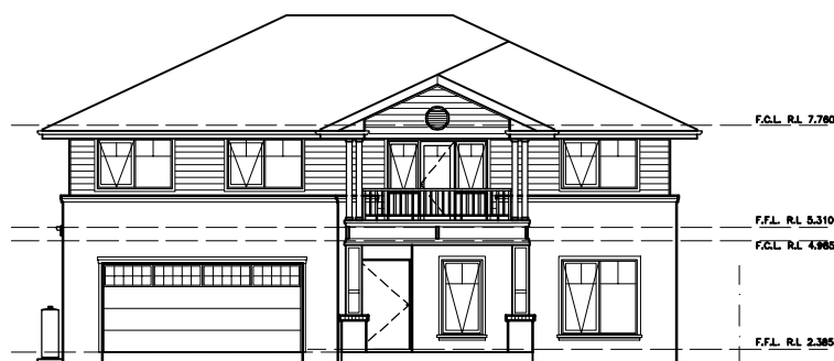
ELEVATION 1 -WEST-